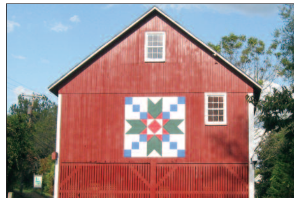
4 HUNT HOMESTEAD - THE HUNT 80 County Road 627, Phillipsburg (Riegelsville)

Continue on South Main Street until the entrance ramp to Route 78 East. Proceed up the ramp and at the top pull over to view the barn on the right.