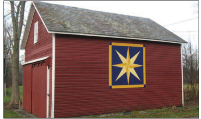
11 SCHAEDEL WAGON SHED - MORAVIAN STAR Lake Just-It Road, Hope

Upon leaving Mackey's, continue on Route 519 N go through the traffic light on Route 46. The barn is 5 miles in on the right hand side.