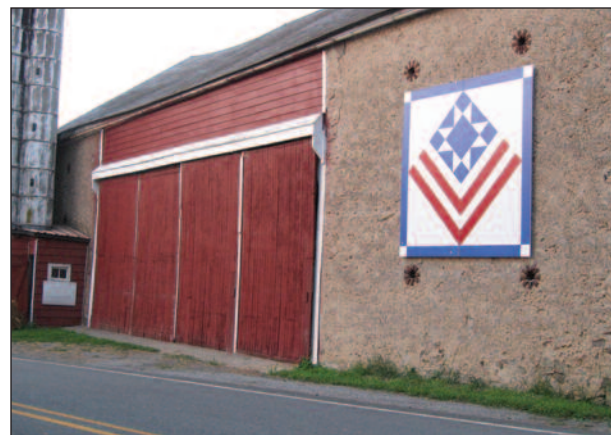
2 OBERLY FARM - PATRIOTIC PRIDE 652 South Main Street, Stewartsville

Proceed on to Route 57 and travel east. Turn right onto North Main Street/CR 637 for .5 miles. Go slowly (right past the Old Stewartsville School) The Cole Barn is on the right.