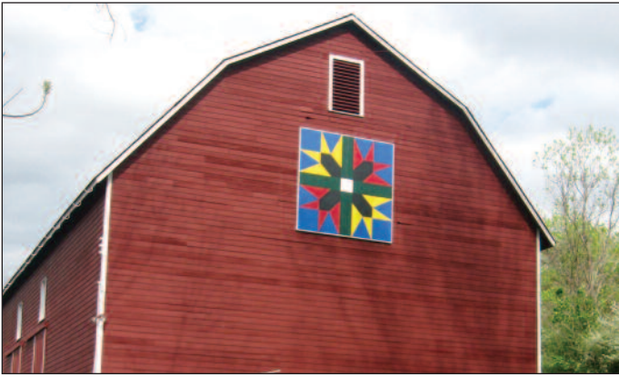
4B SANTINI BARN – BIRDS RESTING 3 Browns Lane, Phillipsburg

Continue back on Route 627, approximately 3 miles to Brown's Lane on the right. Go up lane to the barn at the top of the hill on the right.