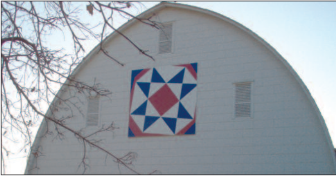
5 FREY BARN – TILTED OHIO STAR 65 Snyders Road, Phillipsburg (Carpentersville)

Continue back on Route 627, approximately 3 miles to Brown's Lane on the right. Go up lane to the barn at the top of the hill on the right.