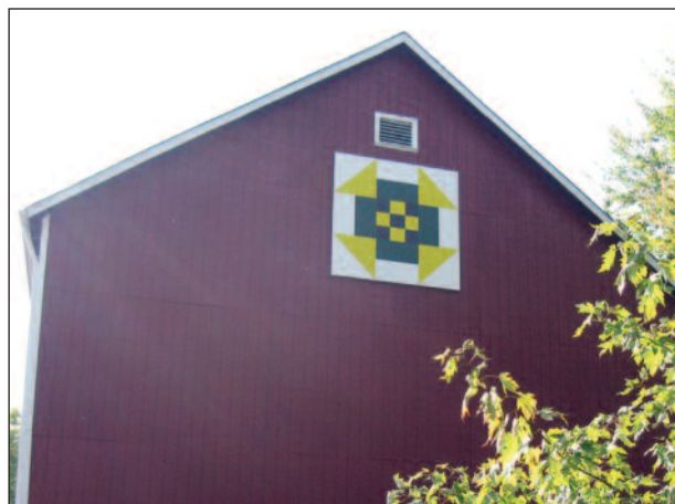
1 COLE BARN - CHURN DASH 510 North Main Street, Stewartsville

The Warren County Barn Quilt Trail begins at the traffic light of the intersection of Route 519 and Route 57.