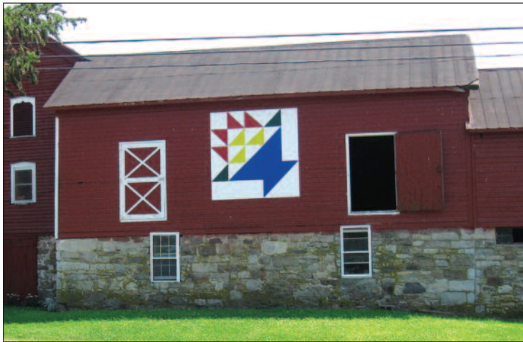
10 PLANER BARN - AUDREY'S BASKET County Road 519, Hope

Continue traveling on Lamplighter Circle; make left turn onto Village Drive to Route 519. Make left and continue on 519 to Mackey's. Farmstand is on the right. Enjoy an Ice Cream Treat!