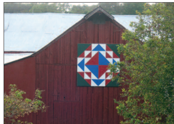
3 DOWLING BARN - CORN & BEANS 715 South Main Street, Stewartsville

Return to North Main Street and turn right. Travel 1.1 miles. Oberly Barn on the left.