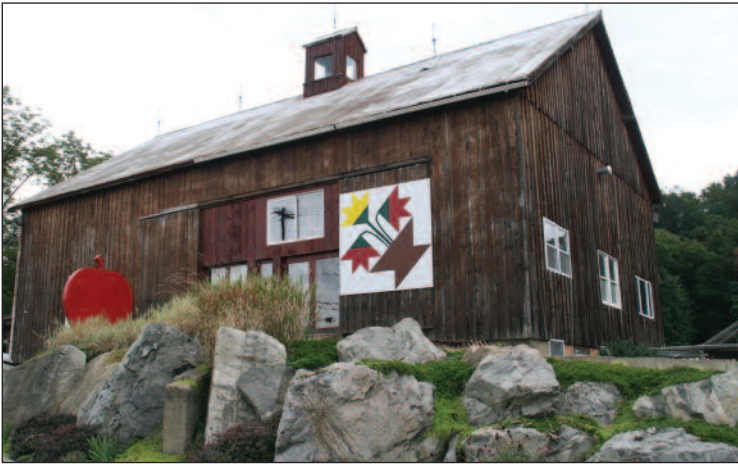
9 MACKEY'S FARM STAND - FLOWER BASKET 284 County Road 519, Belvidere

Continue traveling on Lamplighter Circle; make left turn onto Village Drive to Route 519. Make left and continue on 519 to Mackey's. Farmstand is on the right. Enjoy an Ice Cream Treat!