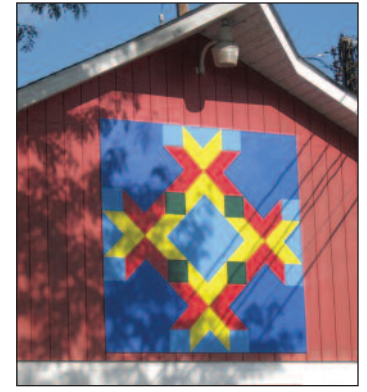
6 & 7 WARREN COUNTY FAIRGROUNDS – THE SUNBEAM (left) COUNTY FAIR (right) Stryker Road / County Road 519 N, Harmony

Return to Route 57 and turn left, continue to Route 519, turn right and proceed on Route 519 N crossing Route 78 and Route 57. Approximate 3/4 to 1 mile is Belview Road. Turn left and go to Stryker Road, turn right. Barn Quilt is on the right on the Traditional Arts Building.