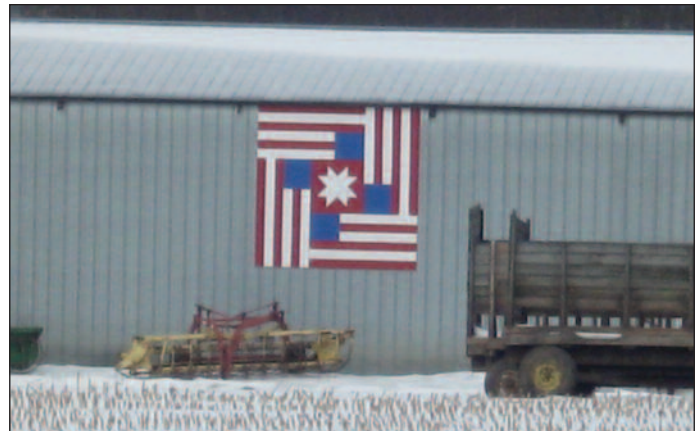
11B BANDUINI FARM (MT. VIEW FARM) - FOUR FLAGS Water Street, Vienna

Leaving the Planer Barn travel a short distance to Lake Just-It Road, turn right, travel approximately 1/2 mile wagon shed is on the right.