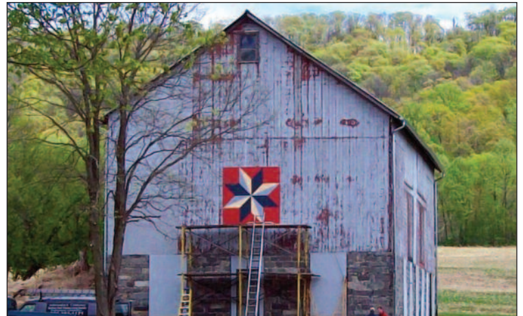
8 HOFF-VANNATTA FARM – EIGHT POINTED STAR – County Route 519, Harmony

Turn around and go out proceed on Stryker Road to Belview Road. Turn left. At the end on Belview Road turn left and proceed on 519 to entrance of fairgrounds. The County Fair Barn Quilt is on the office building.