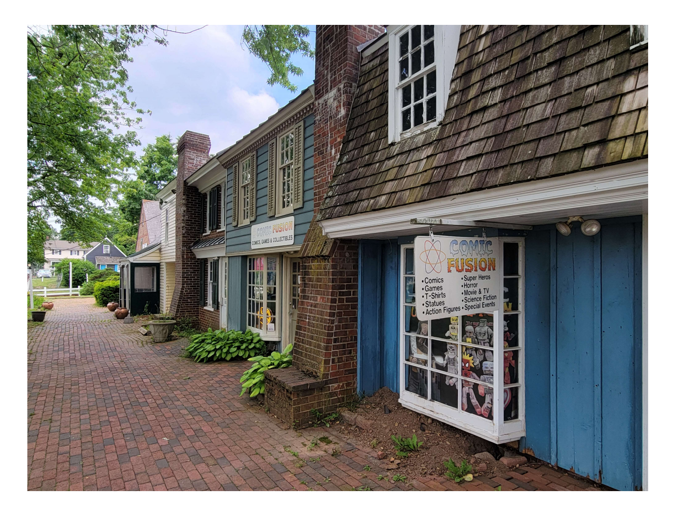
Still here and has been for several years.